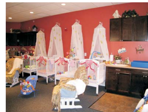
Our newly remodeled infant room is cozy and inviting with warm colors and dimmable lighting

Unlike any other preschool in Naples, Windmill Creek Academy's tree-lined campus affords shaded playing areas in a park-like setting. There is a tire swing, five slides, a large sandbox, a "monkey bar car," picnic tables, and hard-surfaced areas for tricycles and games of hopscotch. We have a custom-made wooden playhouse -- complete with its own landscaping and garden gnomes! A favorite area with the children is a large grassy area for a quick game of soccer! If your child wants to take a moment and simply lay in the grass with a friend and watch the clouds go by in our playground, that's okay too! There's plenty of room to roam and relax.