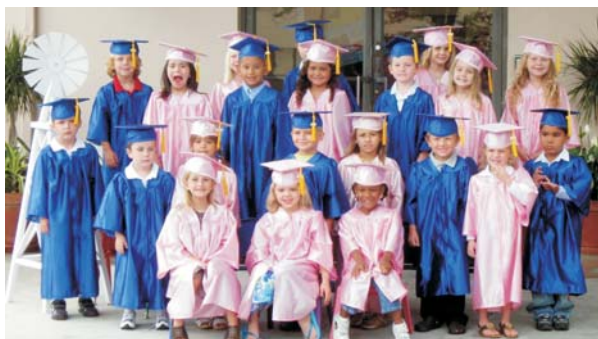
Our 2009 Pre-Kindergarten Graduates!

Our Philosophy is that a child's character is just as vital to their overall growth as a strong academic foundation. Our Character Training Program is interwoven throughout the curriculum and highlights two specific values each month.