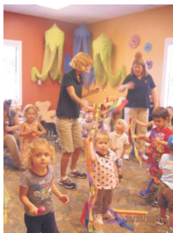
"Groovin" at Music Time!