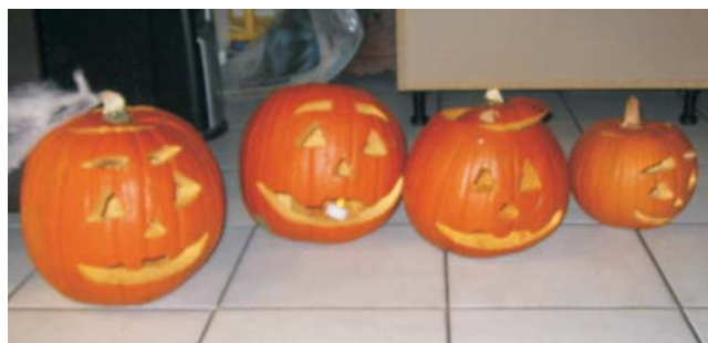
The Giraffes' Carved Pumpkins

Thankfulness - Appreciation & Gratitude Responsibility - Trustworthiness & Dependability