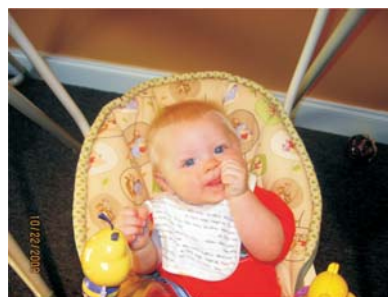
Levi's having a swinging-good time!