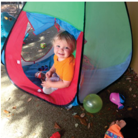
Patrick sets up camp on the playground