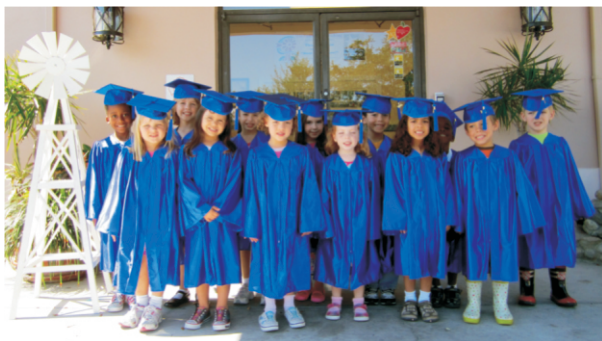
Our Pre-Kindergarten VPK Graduates!

Our Philosophy is that a child's character is just as vital to their overall growth as a strong academic foundation. Our Character Training Program is interwoven throughout the curriculum and highlights two specific values each month.