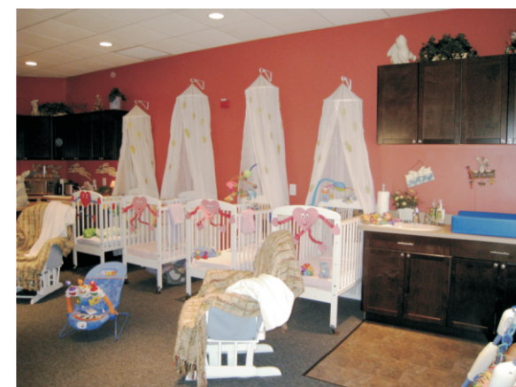
Our newly remodeled infant room is cozy and inviting with warm colors and dimmable lighting

Unlike any other preschool in Naples, Windmill Creek Academy's tree-lined campus affords shaded playing areas in a park-like setting. There is a tire swing, five slides, a "monkey bar car," picnic tables, and hard-surfaced areas for tricycles and games of hopscotch. We even have a custom-made wooden playhouse. Our brand new ten foot by ten foot shaded sandbox is another area for the children to explore. There's plenty of room to roam and relax in our outdoor play areas.